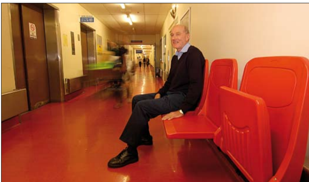
TAKE A SEAT: One of Waikato Hospital’s volunteers has a breather.

corridor is a familiar walkway for patients and visitors and the length of it has been a popular topic of conversation since the opening of the carpark building.