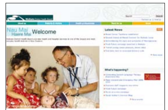
NEW HOME: Waikato DHB’s new look website.

“It is a vast improvement on the previous website and was created with the public in mind.”