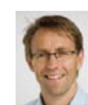
Ashley Bloomfield: Better help for smokers to quit champion:

We're ranked high but it's cold comfort given our actual performance. It is well short of the target and this is the one indicator that most widely involves staff. I ask all health professionals to be active in recording smoking status and offering intervention. The process is simple and does not take long to implement the treatment options. Choosing not to smoke is the single biggest lifestyle choice our patients can make. Waikato DHB achieved a higher prevalence rate so is identifying more smokers.