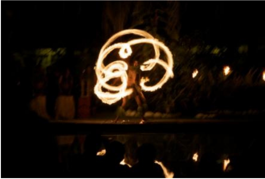
Fire dance at Aggie Greys in Apia.