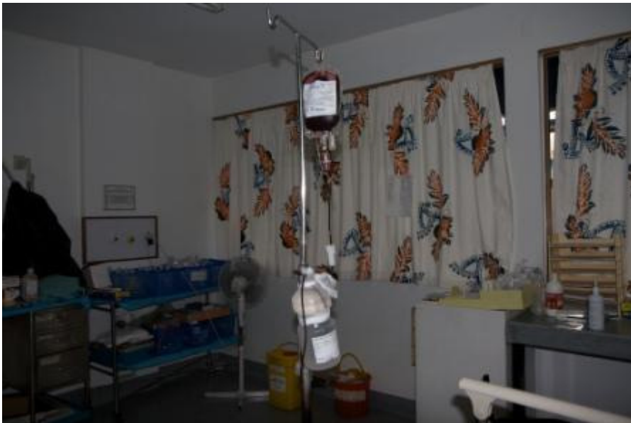
Blood warmer in PACU.