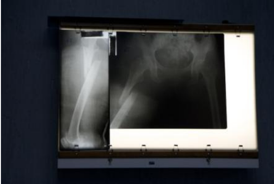
The broken femur