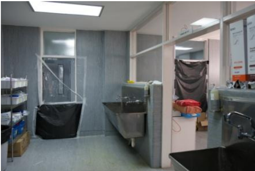
Our attempt to have a closed theatre for a femoral plating.