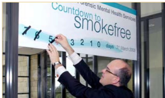
VISITING: Tony Ryall makes his mark at Henry Rongomau Bennett Centre during his visit.

Tony Ryall, Minister of Health, visited Waikato Hospital. His programme included visits to the Henry Rongomau Bennett Centre, where he launched the smokefree initiative, a meeting with the board, visits to the Renal Unit, Transit Lounge, Oncology Services, Endoscopy Centre, HDU and ICU, Emergency Department, Newborn Intensive Care Unit and the Delivery Suite.